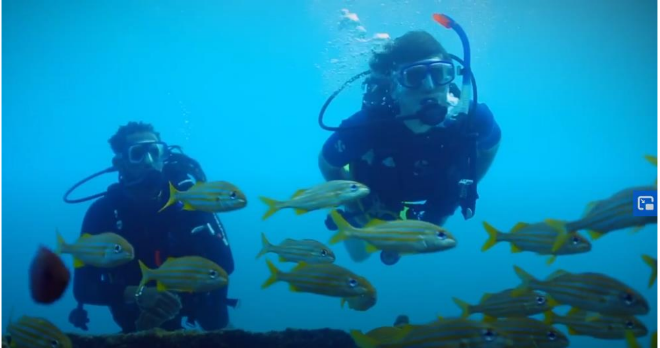
The Caribbean . . . Episode 2